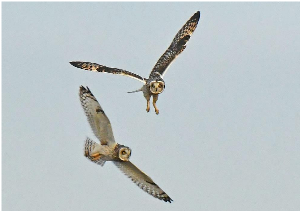
Short-eared Owls at Bogside

Very few records of this elusive species. 1 Craigs Kirkoswald 17 Jan, 25 Feb, 1 Hunterston 31 Jan, 1 Auchinleck 10 Mar, 1 Drumboy Hill 23 Oct.