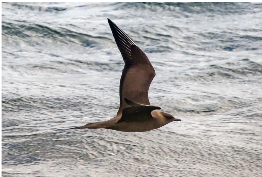
Arctic Skua at Stevenston Point (Dougie Edmond)