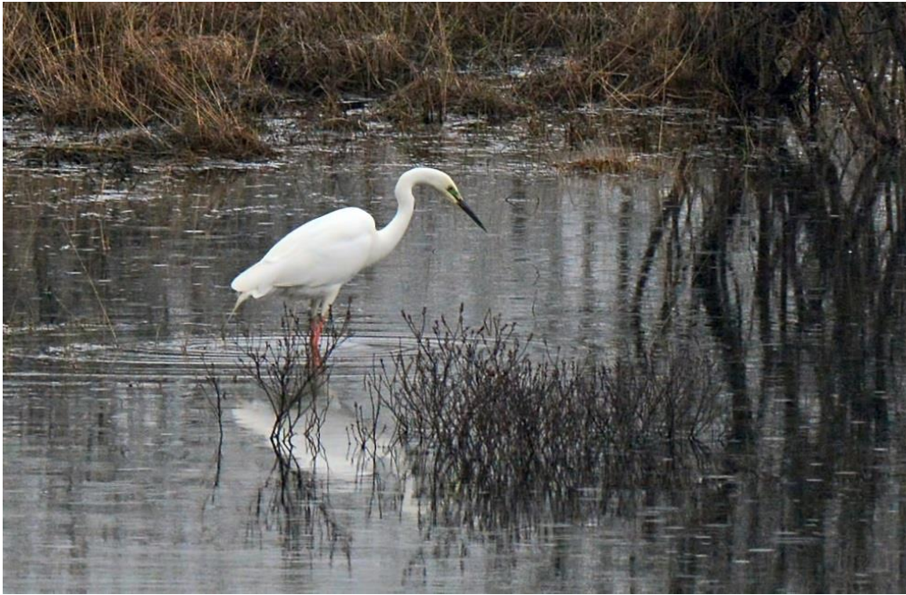
Great Egret at Garpel Bridge, Loch Doon ( Angus Hogg )