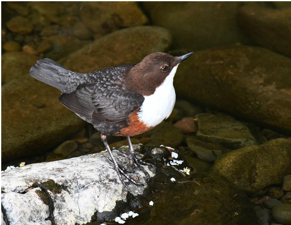
White-throated Dipper at Glen Afton (Angus Hogg)

In autumn the last birds were singles at Troon on 12 Oct and Stevenston Point on 4 Nov.