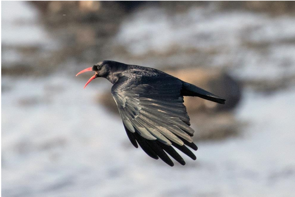
Red-billed Chough at Turnberry Point (Dougie Edmond)