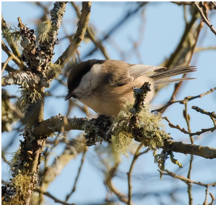
Willow Tit at Bogton (Dave Grant)

Counts and post-breeding groups included 10 Loch Doon dam 1 Jan, 11 Fullarton Woods 10 Feb, 13 on 20 Oct, 11 Shewalton Wood 28 Apr, 23 Jun, 23 on 25 Aug, 15 Collennan 2 Jul, 10 Loans 21 Jul, 8 Knockshinnoch lagoons 1 Sep.