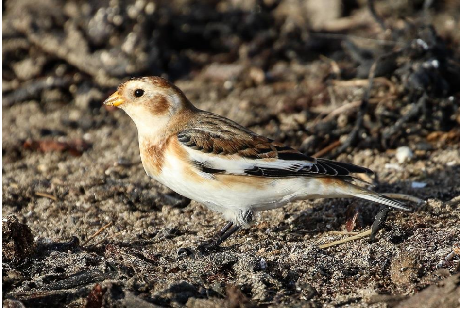
Snow Bunting on Troon South Beach (Dougie Edmond)