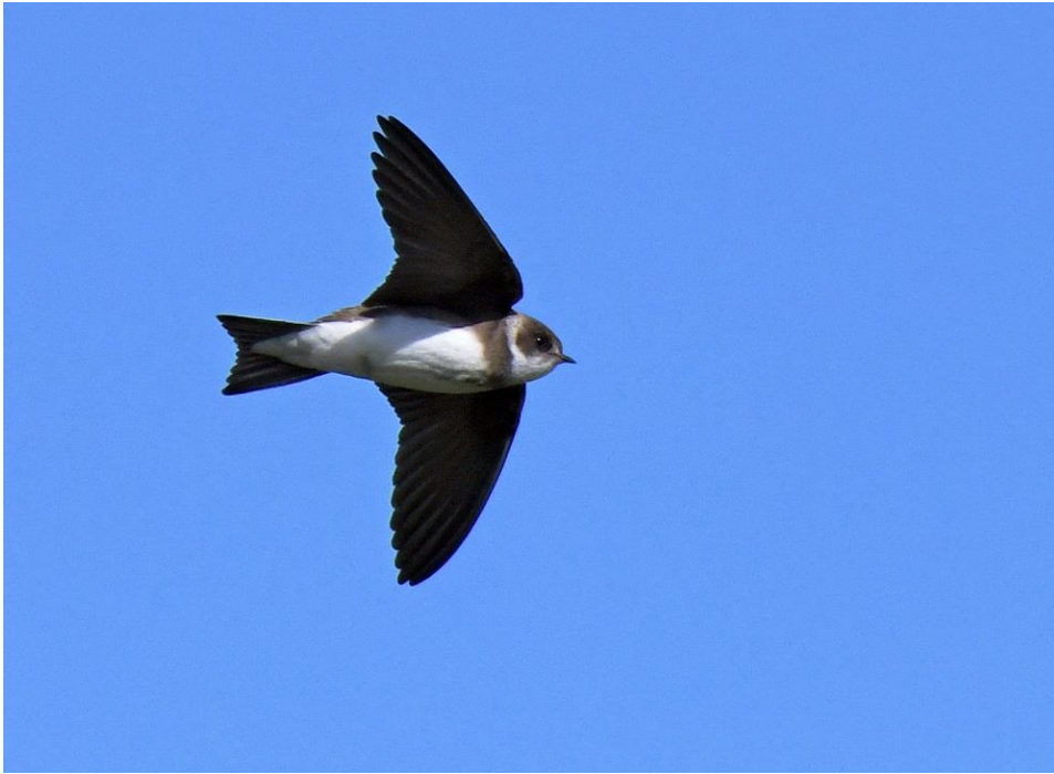
Sand Martin at Kilkerran