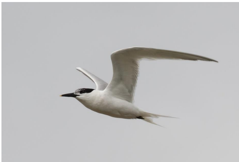
Sandwich Tern at Doonfoot– (Dave Grant)

Wintering adults included: numerous single figure records around Troon throughout winter, plus 11 Doonfoot 18 Feb.