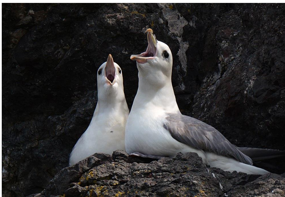
Northern Fulmars near Ballantrae (Angus Hogg)

Three autumn records: 1 S Maidens 31 Aug (RHH/DGr), 2 off Troon 3 Sep (DGi/DC), 2 S Maidens 6 Sep (DGr).