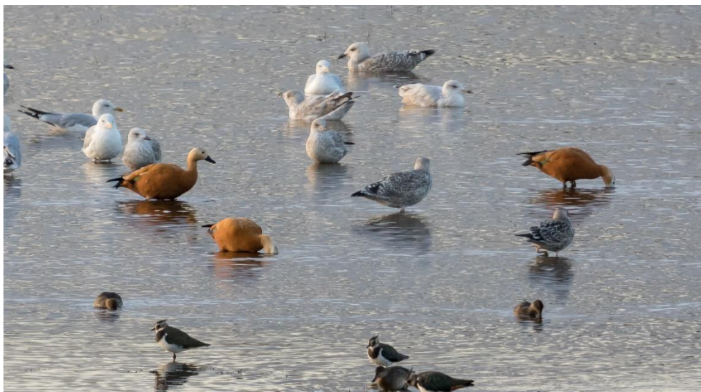
The party of three Ruddy Shelduck at Fail (Dave Grant)