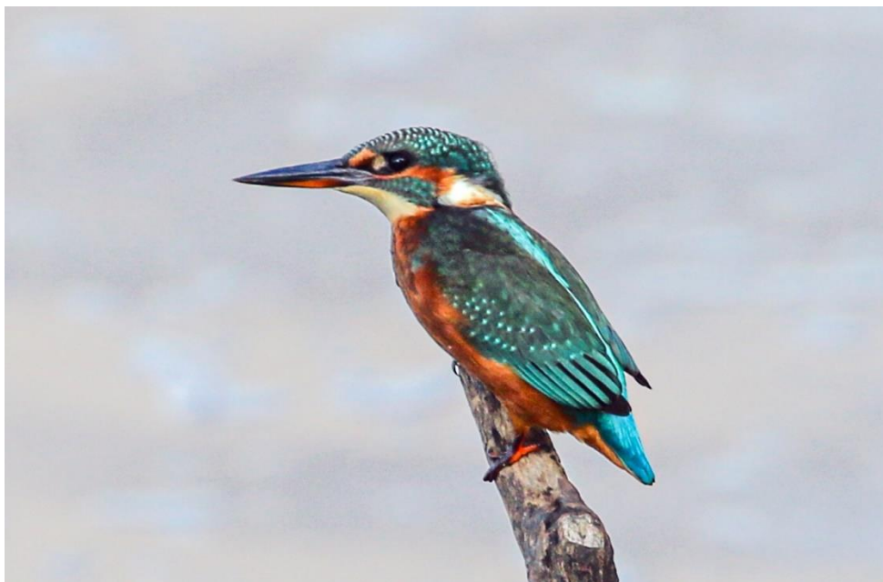
Common Kingfisher at Pow Burn