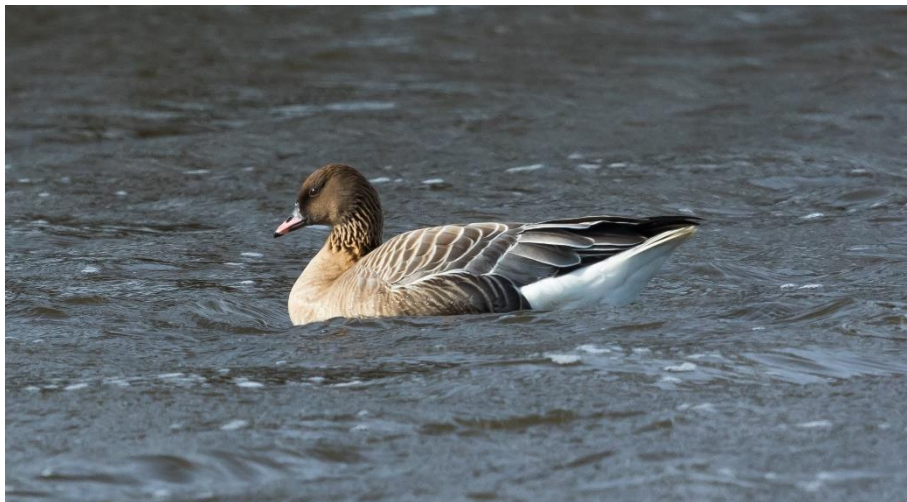
Pink-footed Goose at Martnaham