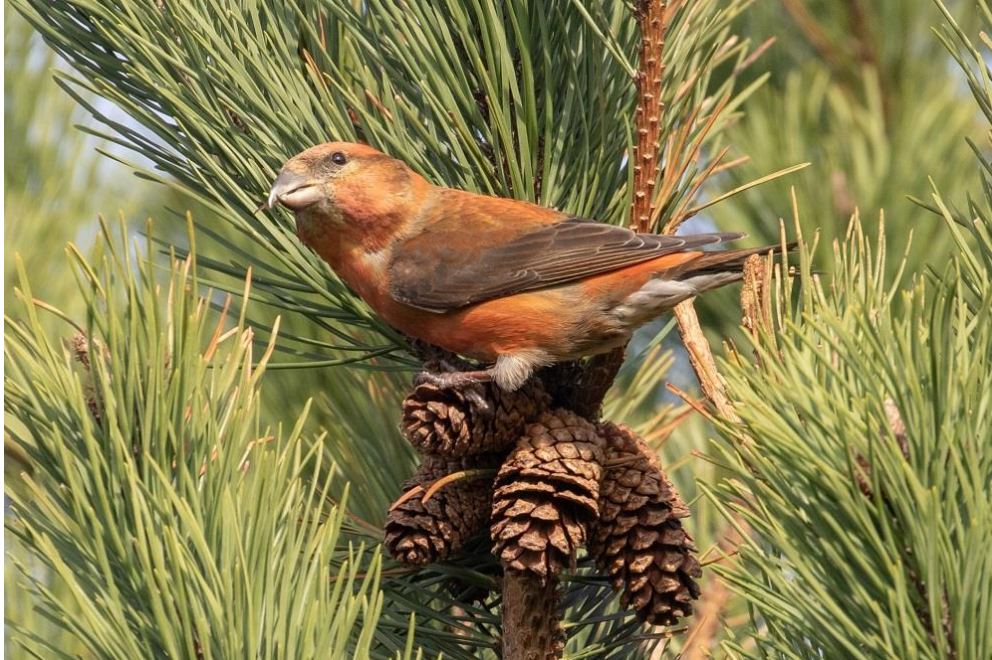
Male Common Crossbill at Bogside (Dougie Edmond)