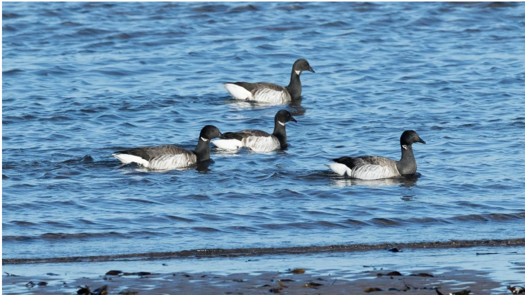
Pale-bellied Brent Geese at Maidens