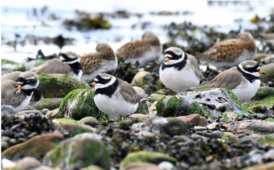
Ringed Plovers and Dunlin roosting at Balkenna (Angus Hogg)