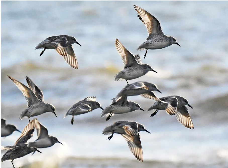
Red Knots landing at Troon (Angus Hogg)