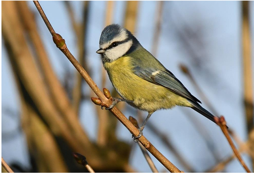
Blue Tit at Crosshill (Angus Hogg)