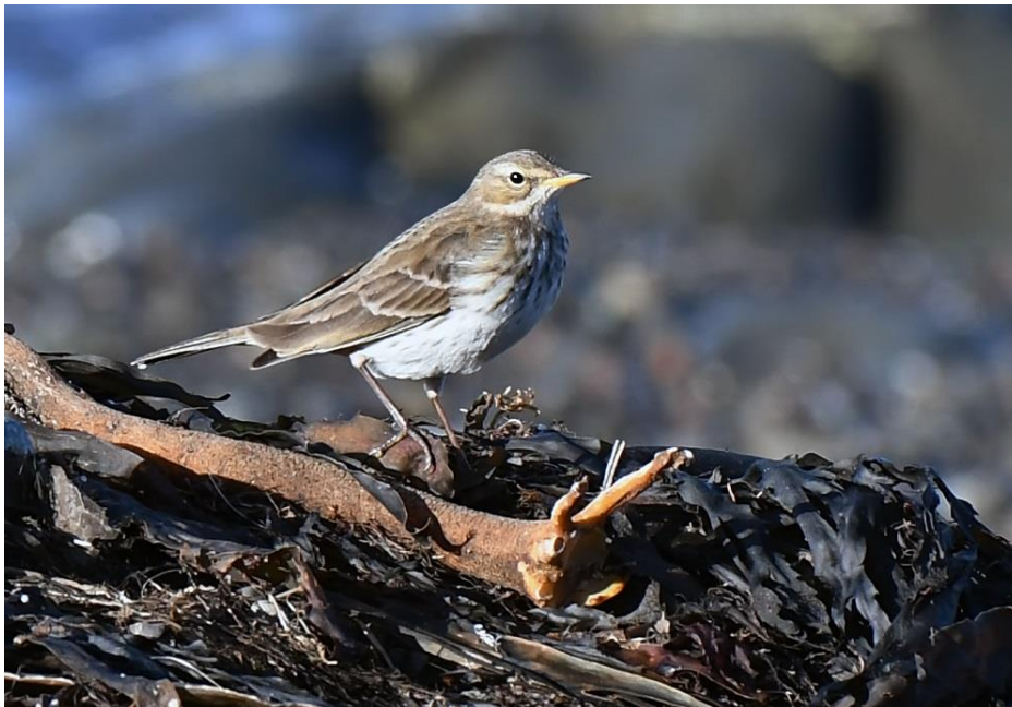
Water Pipit at Lendalfoot (Angus Hogg)

Arrival was from 10 Apr when 1 was at the Gala Lane. This was followed by singles at Mochrum Loch on 14 Apr and Ness Glen on 21 Apr.