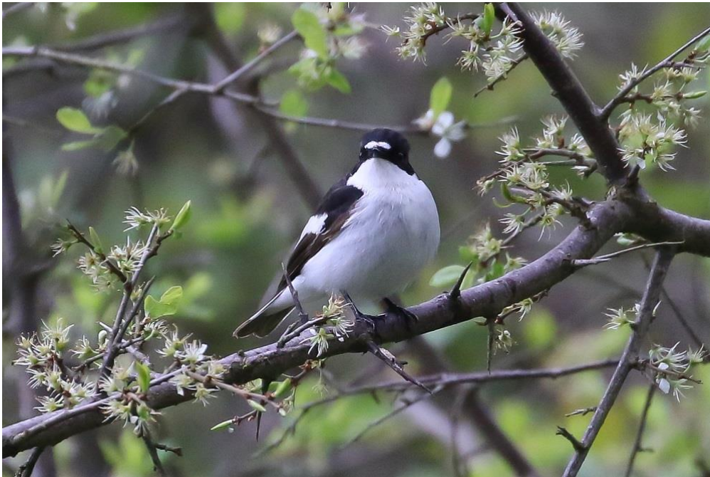
Pied Flycatcher in Glen Afton (Dougie Edmond)

Counts and migrants included 17 Fullarton Woods 29 Jan, 16 on 1 Sep, 11 Shewalton Wood 28 Apr, 11 Garnock Floods 18 Oct, 20 Eglinton CP 18 Nov, 20 Knockentiber-Springside cycle path 28 Dec.