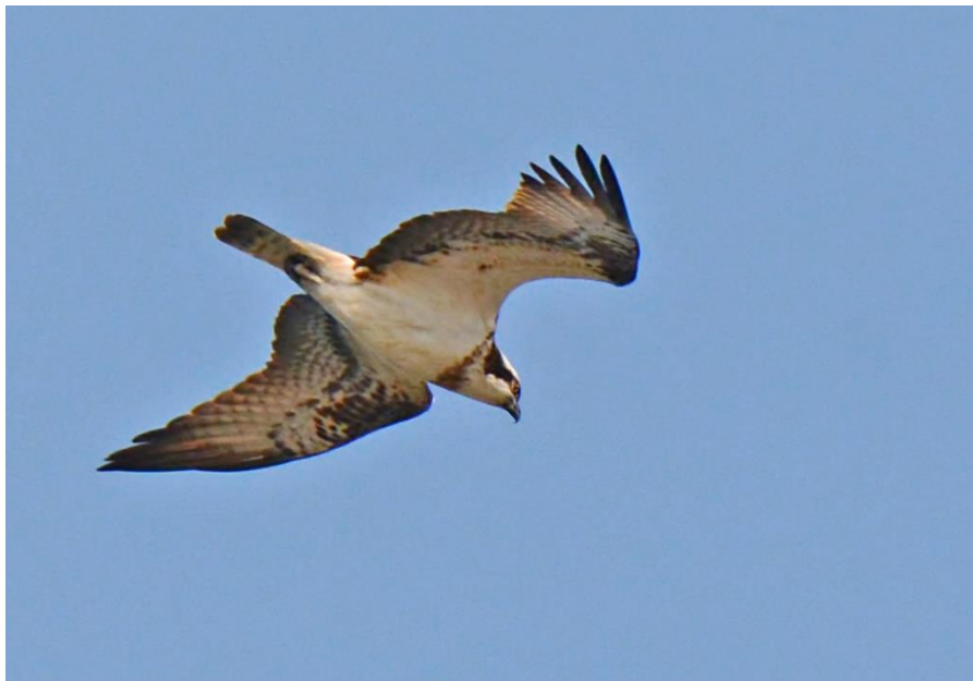
Osprey over Maidens ( Angus Hogg )

Precise totals for this rapidly expanding species are difficult, but at least 12 individuals were present during year, involving the following: 2 Garnock Floods-Irvine 1 Jan-22 Nov, 3 on 11 Jan, 2 on 5 May, 1 Pow Burn-Loans 5 Jan-30 Mar, 1 on 2 Jul-31 Dec, 2 on 3 Dec, 1 Doonfoot-Heads of Ayr 6 Jan-4 Apr, 2 on 19-24 Jun, 1 on 4-21 Nov, 1 Fairlie-Seamill 8 Jan-14 Sep, 2 on 20 Oct-1 Nov, 3 on 28 Oct-30 Dec, 4 on 21 Dec.