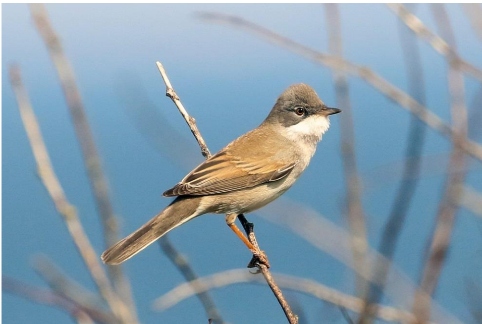
Common Whitethroat at Deil's Dyke (Dougie Edmond)

The last departing bird was seen at Garnock Floods on 2 Jul.