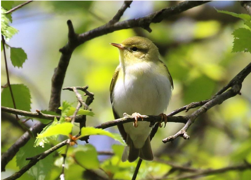
Wood Warbler in Ness Glen

Counts included 11 Knockshinnoch lagoons 1 Sep, 15 Hunterston Sands 11 Sep, 21+ Mark Glen App 2 Oct, 12 Trabboch Loch 6 Oct, 10 Whitelee windfarm SW 13 Oct, 13 Fail 19 Oct, 10 Cumnock Kings Drive 19 Oct, 11 Saltcoats Sharpill Road 19 Oct, 10 Bogton Loch 14 Nov, 10 Garnock Floods 22 Nov, 11 Drybridge Park 24 Nov, 12 Gypsy Pool 28 Nov, 15 Fullarton Woods 4 Dec, 17 Knockentiber-Springside cycle path 28 Dec.