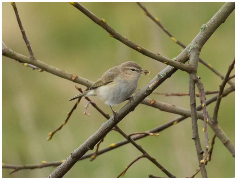
Auchenhavie's Siberian Chiffchaff (Dave Grant)

1 Auchenhavie 2 Dec, 1 Hunterston 20 Dec, 1 Knockentiber-Springside cycle path 28 Dec.