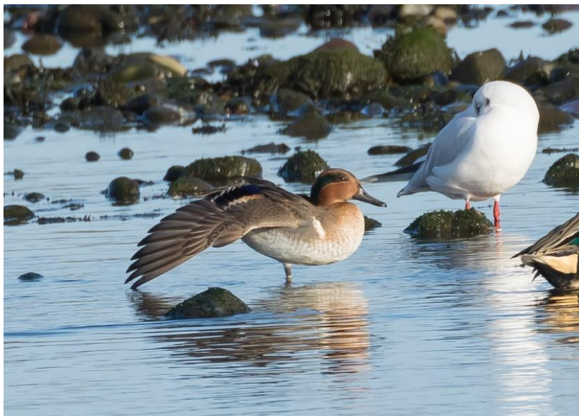
Green-winged Teal at Doonfoot