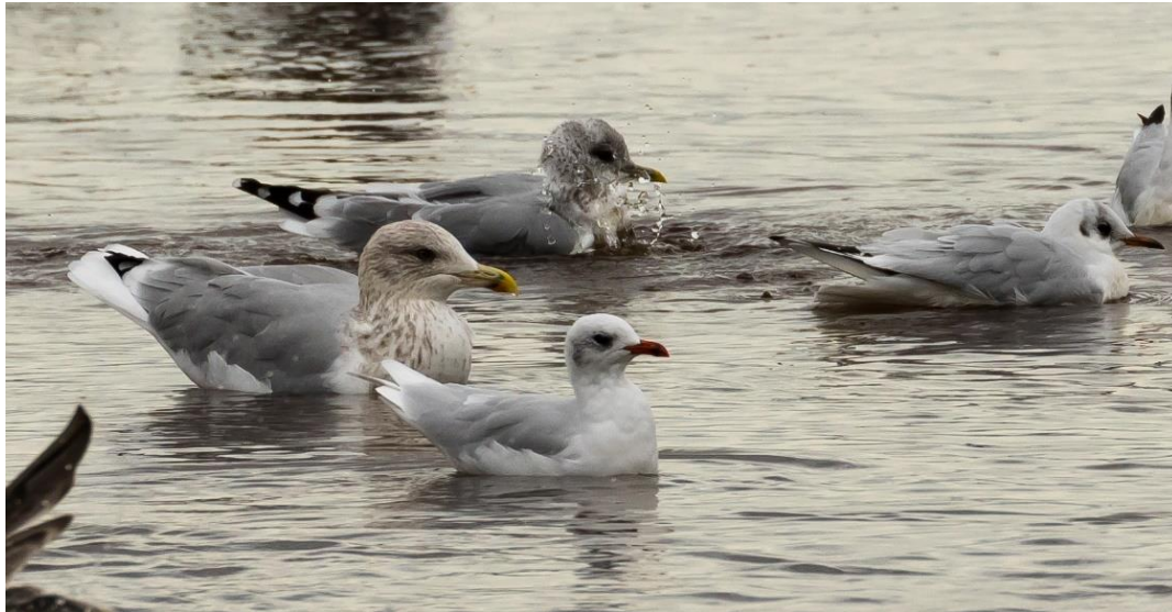
Mediterranean Gull with Herring Gull at Troon