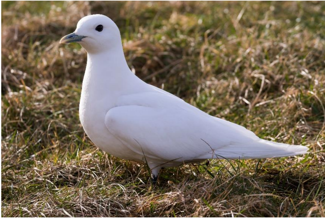
Adult Ivory Gull released at Stevenston Point (Dave Grant)