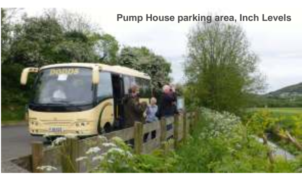
Day 6 Saturday 20 May 2017