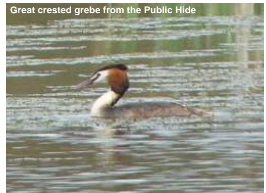
Great crested grebe from the Public Hide