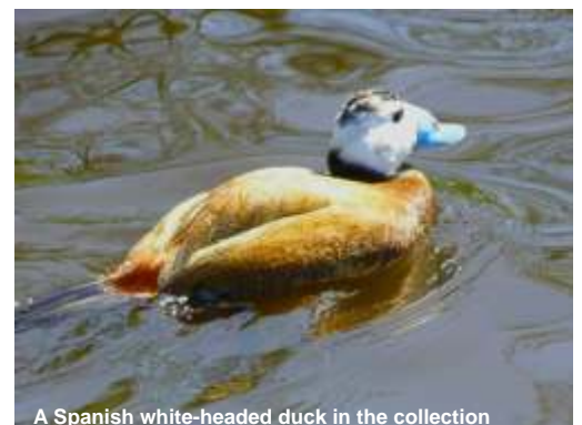
A Spanish white-headed duck in the collection