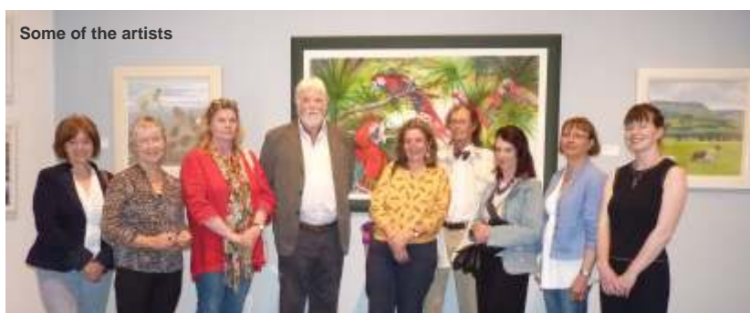
Some of the artists