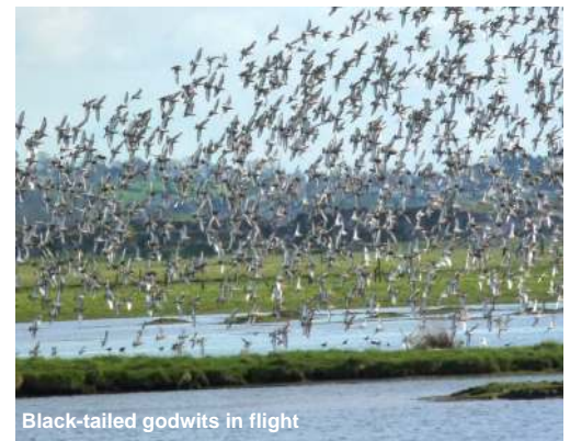
Black-tailed godwits in flight