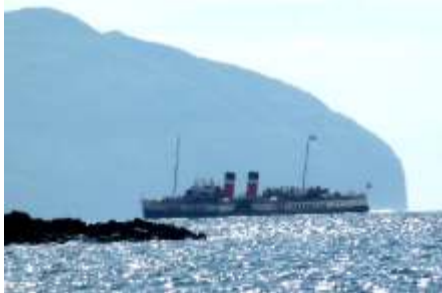
PS Waverley off Ailsa Craig on 18 July 2011