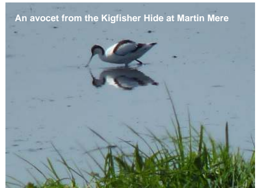
An avocet from the Kigfisher Hide at Martin Mere