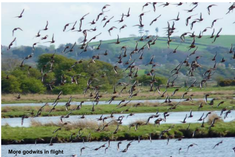
More godwits in flight