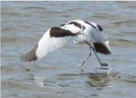
An avocet 'walking on water' - taken from the Eric Morecambe Hide at Leighton Moss, April 2011.