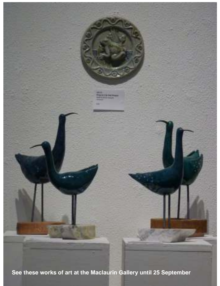
See these works of art at the Maclaurin Gallery until 25 September