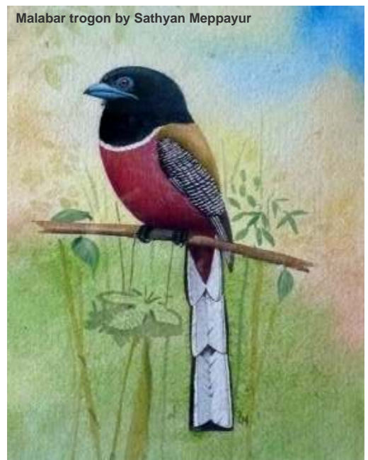
Malabar trogon