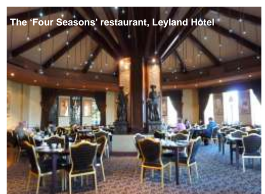
The 'Four Seasons' restaurant, Leyland Hotel