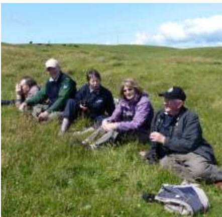
Some of our group on the June 2011 field trip to RSPB's Mull of Galloway Reserve.

Ailsa Craig gannetry from PS Waverley cruising from Ayr and Girvan - 03 July 2011