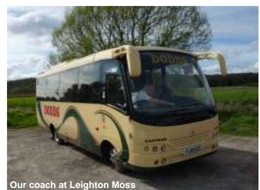
Our coach at Leighton Moss