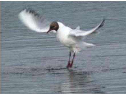
A black-headed gull trying to impress. Taken at the Public Hide, Leighton Moss on our April weekend