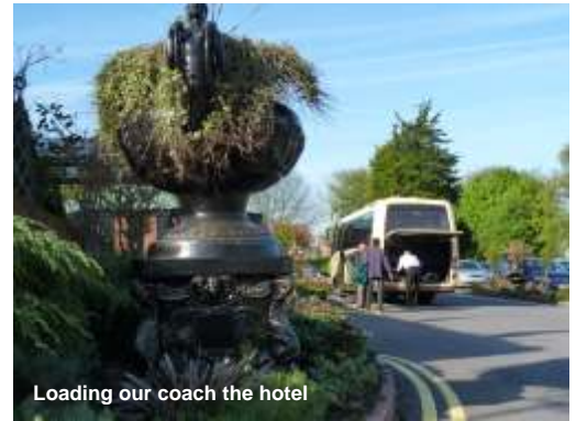
Loading our coach the hotel

We then returned via Dumfries once again (as the Douglas Road - the A700, was closed for repairs over the weekend. We were back at Dodds coach depot in Ayr for at exactly 22.01 hrs (just two hours and one minute's drive from Longtown. Not bad. Everyone agreed that we had a super weekend and I would like to thank all those participating for their good company. We look forward to the next time, when we will spend three days away on the Northumberland coast - visiting the Farne Islands and Coquet Island. The dates? Saturday 23 to Monday 25 June 2012. Full details elsewhere in this newsletter.