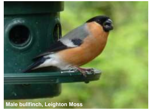
Male bullfinch, Leighton Moss

We then joined the M6 once again to speed on to our hotel for the night, the Best Western Leyland Hotel, a well-appointed four-star establishment not far from the motorway. Rebecca, the friendly and helpful receptionist, soon had us checked in and - apart from one wrong room type (which was also soon rectified) we were all happy with our accommodation and met once again for a pre-dinner drink in the main lounge and bar area. It was good to see that at least one real ale was available - a very nice local beer - Thwaites Wainwright - named after the well-known rambler, artist and writer who lived in the Lake District. Saturday night was fairly busy of course, and a wedding was taking place in one of the numerous suites. Dinner was booked for us in the main restaurant - the 'Four Seasons,' where we all enjoyed a three-course meal. There was a choice of steamed supreme of chicken filled with creamed leek and spinach, and laced with a wild mushroom sauce; or alternatively, slowly roasted sirloin of beef with traditional Yorkshire pudding and horseradish gravy. A vegetarian option was also on the menu of course. To start, the cream of vegetable soup with thyme and sage was really good, and the temptation to try a dessert called 'Lancashire Belles' was too great, although it must be said, some found this a little disappointing. The Parkin-flavoured ice cream that accompanied it was quite pleasant though. A very fine day was rounded off with a nightcap and a chat in the bar.