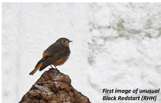
First image of unusual Black Redstart (RHH)

During the morning of Tuesday 13/11/18 Angus Hogg (RHH) saw and photographed an unusual looking Black Redstart at Hogston Farm, near Maidens, south Ayrshire. Reviewing the image on the computer it was apparent that this was not a 'normal' Western type Black Redstart. The rufous orange belly and the apparent contrasting breast band suggested further investigation of this bird was required, as this bird may be of an eastern form. The bird was not seen again until Friday 16/11/18. The bird appeared on the wood pile at approximately 1145hrs and Dave Grant (DG) watched and photographed it for approximately 1 hour 20 minutes. Further visits were made on 17-19/11/18 by DG and RHH but there was no sign of the bird.