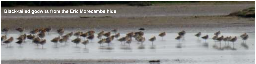
Black-tailed godwits from the Eric Morecambe hide