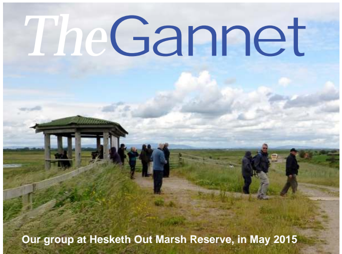
Our group at Hesketh Out Marsh Reserve, in May 2015

For all local birding details - log on to: www.ayrshire-birding.org.uk