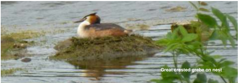
Great crested grebe on nest

We were here until 15.40 hrs - time enough for walks covering the riverside, woodlands and lakes. We visited three hides on our meanderings, one very close to nesting great crested grebes. We also had good views of shelduck, common sandpiper and a variety of ducks and gulls. From the pathways we saw and heard blackcaps, garden warblers, chiffchaffs and common whitethroats. Swifts were swooping overhead and a few kestrels were hovering as the weather improved in the early afternoon. Brockholes has great potential and we enjoyed our visit to this easily accessible reserve.