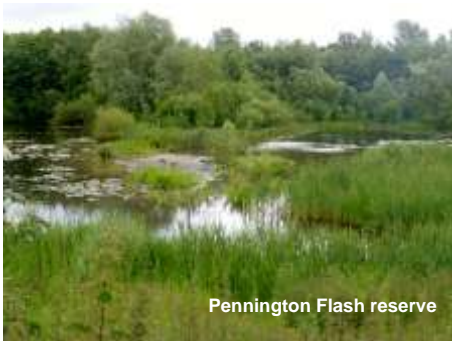
Pennington Flash reserve

Pennington and all the other Wigan flashes (or lakes) are a legacy of the town's industrial past and were formed as a result of mining subsidence. Some of the flashes were partially filled with colliery waste and ash from the nearby Westwood power station. Ince Moss colliery closed in 1962 and Westwood power station was demolished as recently as 1989. Natural colonisation and large-scale reclamation works have helped heal the industrial scars, turning the area into the amenity it is today. The reserve is part of a larger network of important wetland habitats, running for approximately 9km along the Leigh branch of the Leeds Liverpool canal. These include Hey Brook, Abram Flashes SSSI, Pennington Flash and Hope Carr nature reserve. Wigan flashes habitats include large areas of open water, reedbed, fen, rough grassland, wet woodland and scrub. Over 200 species of birds, 15 species of dragonfly and six species of orchid have been recorded. The elusive bittern is regularly recorded in winter months and work to improve and manage the reedbeds is aimed at attracting this nationally rare bird to stay and breed.