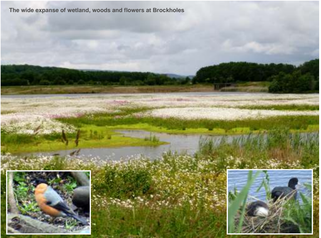
The wide expanse of wetland, woods and flowers at Brockholes