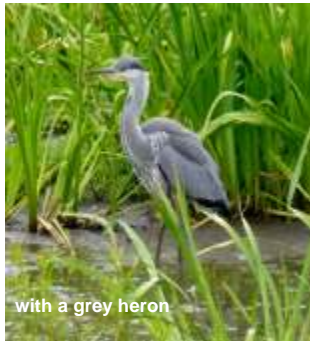
with a grey heron