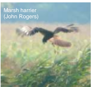
Marsh harrier (John Rogers)

Staying for eight nights at the friendly, family run 4* HOTEL NATIONALPARK ILLMITZ once again - ideally placed on the very edge of the Nationalpark NEUSIEDLERSEE - SEEWINKEL. The hotel has most spacious rooms with en-suite accommodation, swimming pool and open-air cafe-terraces. The cuisine is excellent with many regional dishes and local wines.