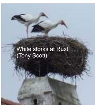
White storks at Rust