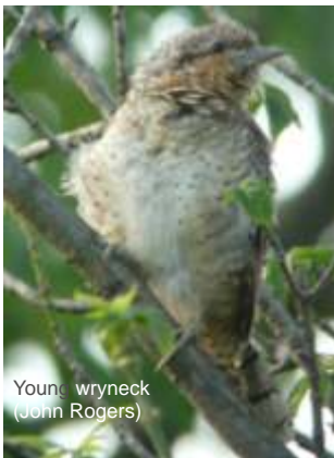
Young wryneck

Our group in August 2007 at Rabensburger Weiden on the Austrian-Czech border